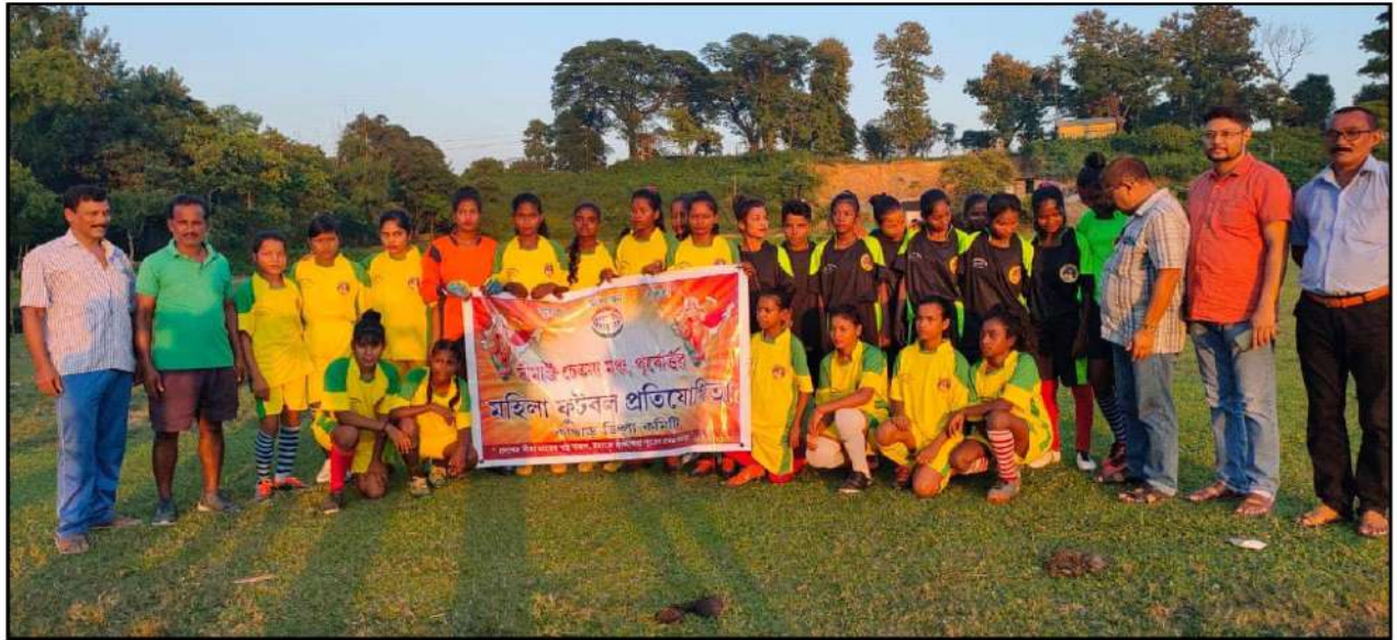
Female Football match on dated- 24/08/2020.